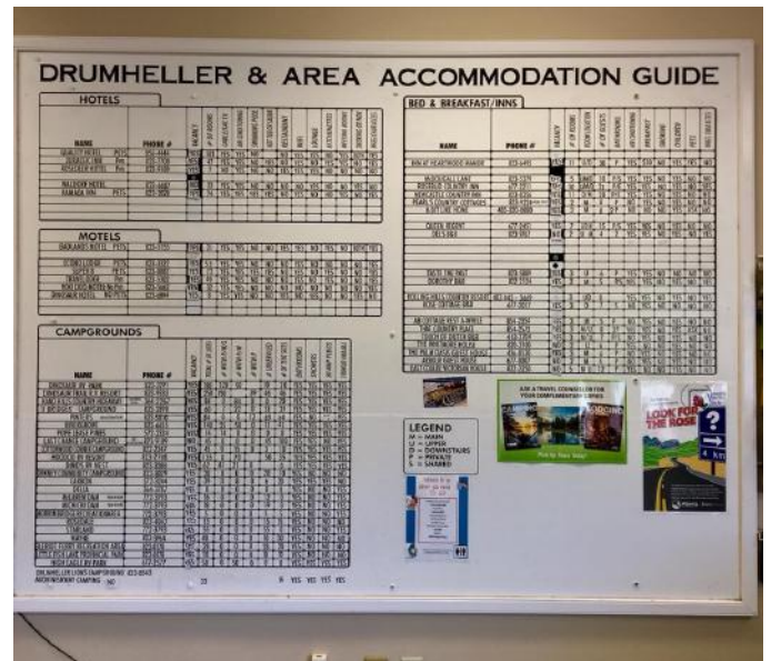
Our large and comprehensive accommodations board is the envy of many VIC's!