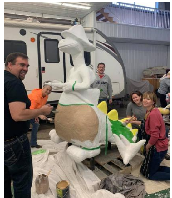
Members and volunteers paint the Fire Fighter Dino