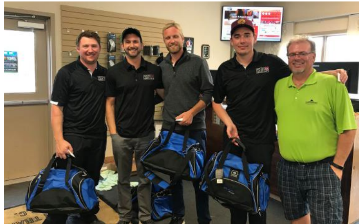
'Jurassic Classic' Chamber Golf Tournament