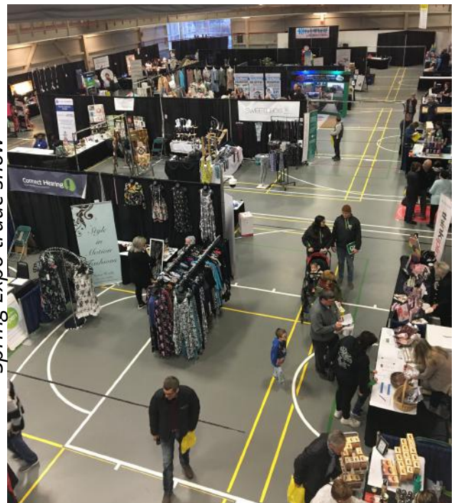
Spring Expo trade show