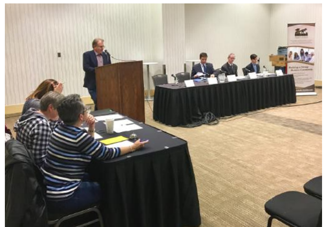
Federal election forum