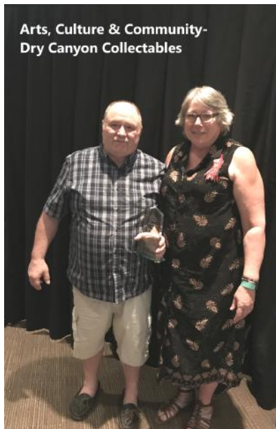
Arts, Culture & Community- Dry Canyon Collectables