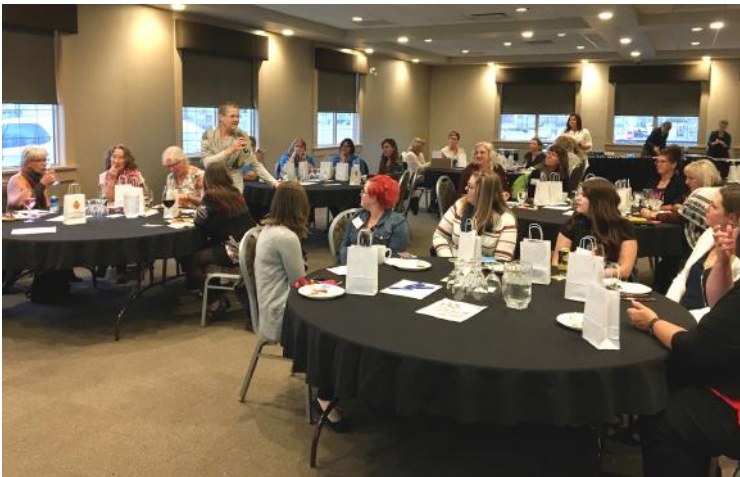
Annual Women in Business Mixer