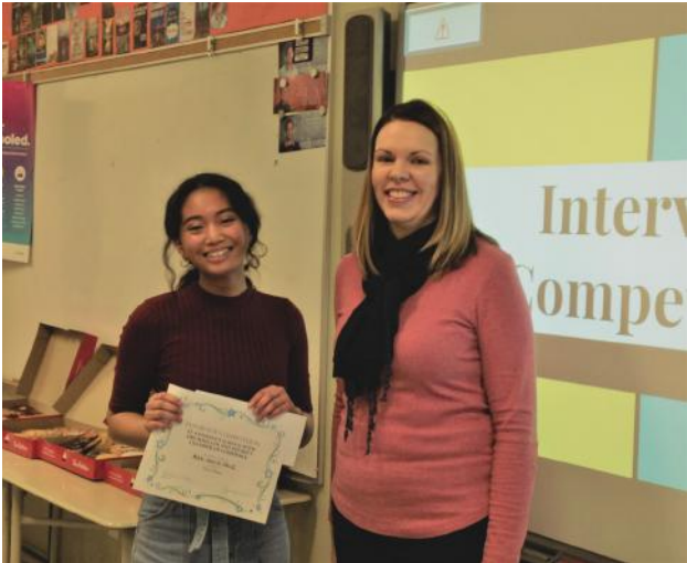
5th annual 'You're Hired Interview Competition'