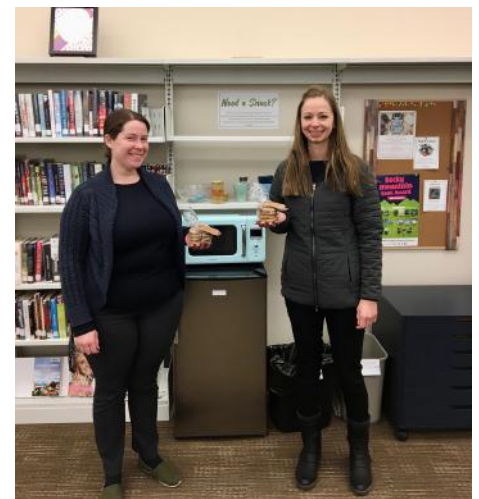
Visiting members with cookies during Small Business Week

My instinct is to answer "where do I start?!" because there isn't a simple answer that covers everything. But I like to think of our organisation as a connector, a problem solver, a resource, and a cheerleader for our business community. No day is the same- I can go from working on the Spring Expo trade show to helping someone plan a conference to looking at DinoArts dinosaur designs and booking The Little Church for a wedding all within an hour!