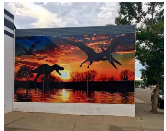
New mural at Aagaard's Upholstery