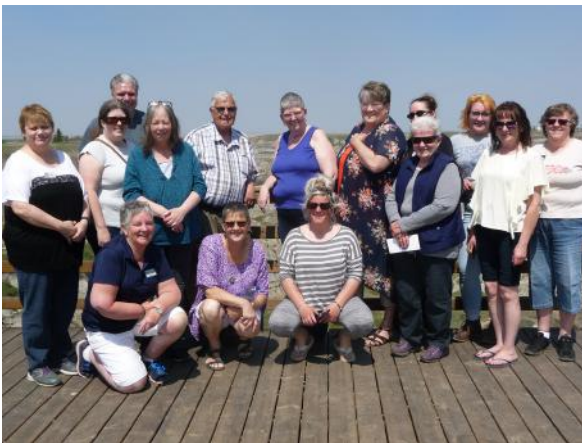
2020 FAM Tour